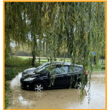
Flooding at Radipole Lake

prompted Dorset Council to promise a review of the current situation at the lake and an investigation into what actions have, or should have, taken place over the last decade. We'll update you on progress as we have it.