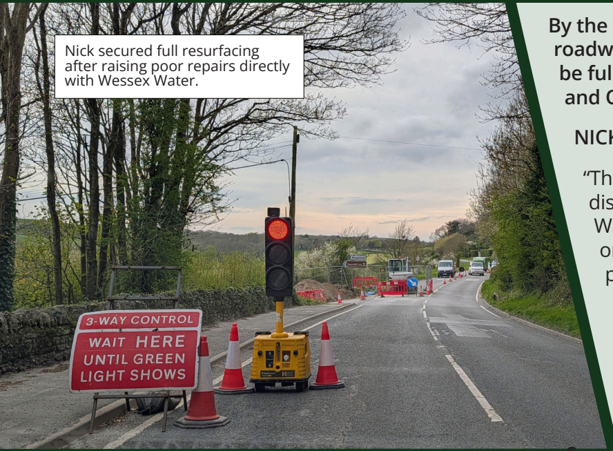
Nick secured full resurfacing after raising poor repairs directly with Wessex Water.

By the time this Focus is delivered, the Wessex Water roadworks should be finished. However, there will still be full resurfacing works carried out between Poxwell and Osmington over several days in late May.