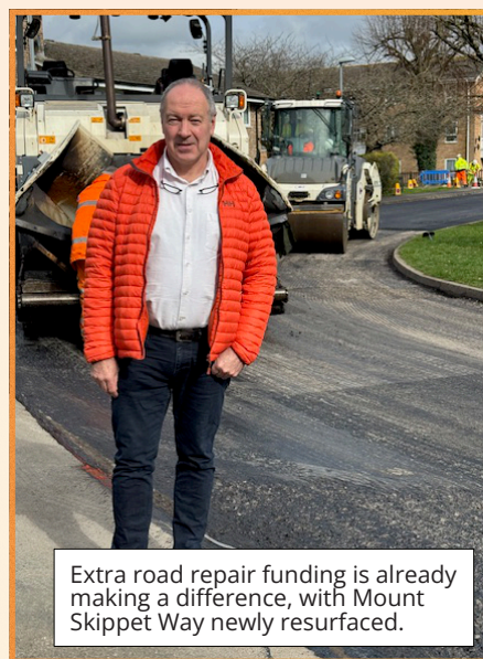
Extra road repair funding is already making a difference, with Mount Skippet Way newly resurfaced.

There's already some progress to see, with Bingham's Road and Mount Skippet Way in Crossways newly resurfaced. And there's more on the way — roads in Warmwell, Poxwell, Osmington and Owermoigne are all scheduled for resurfacing over the next few months.