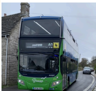
Lib Dems campaigning for better bus services.

Residents have raised the need to improve bus services for our local villages, such as Harman's Cross and Worth Matravers. There is no bus service for Harman's Cross outside the summer months leaving residents isolated during the winter. Dorset Council say they cannot afford to change this, despite recently receiving a 50% increase in funding from central government to improve local bus services.