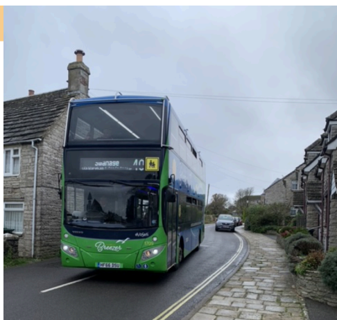
The 40 bus - A vital service for our area