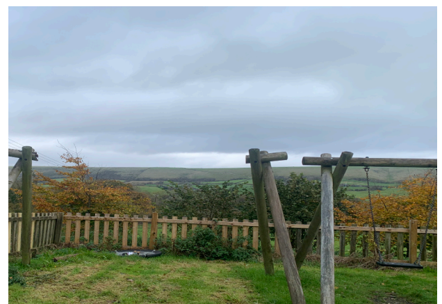
Broken swing in the children's play area, Nine Barrow View

The Lib Dems have contacted the Housing Association about the broken swing and poor upkeep of the play area. They have promised to do remedial work.