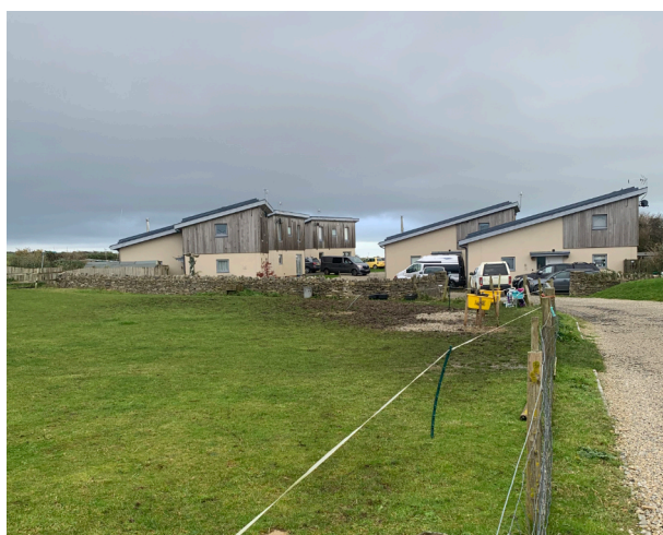
Community land trust development for locals in Worth Matravers

Nationally, Liberal Democrats at their recent conference agreed that local authorities should have greater power to control the conversion of houses to be used as second homes so that villages like Langton do not become like ghost villages outside the Summer.