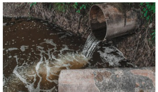
Liberal Democrats are campaigning against Sewage outfalls

Liberal Democrats locally and nationally are campaigning for the water companies and their regulators to give a higher priority to cleaning up our local rivers and sea.