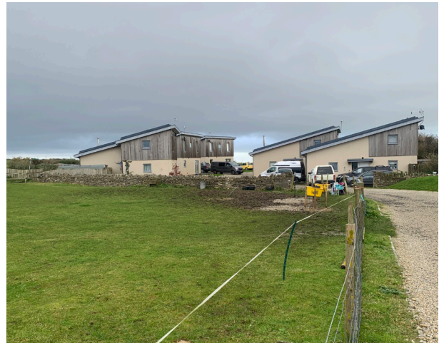
Community land trust development for locals in Worth Matravers

Liberal Democrats agreed at their recent National Conference that local authorities should have greater control over the use of houses as second homes in areas such as Studland where they risk the village becoming a ghost village outside the Summer.