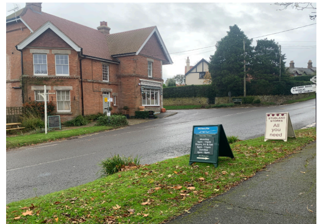
Suggested location for a pedestrian crossing, Main road near Studland Stores

Residents raised the need for a pedestrian crossing across the main road near Studland stores. We have raised this with Dorset Council and they have said various options are being investigated.