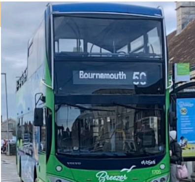
The 50 bus - A vital service for our area