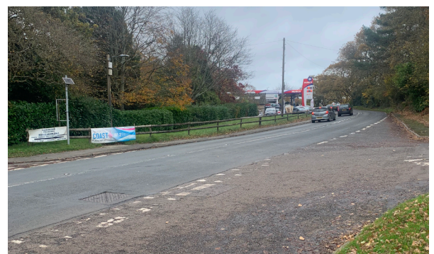
A pedestrian crossing is needed in Harman's Cross

There is also a need to ensure that the speed limits are adhered to in Worth Matravers. We have raised these issues with Dorset Council and the police.