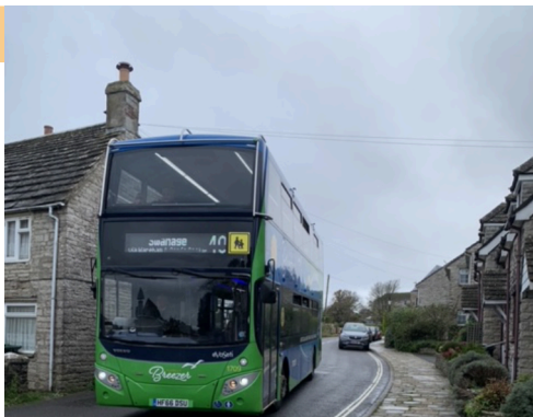
Improved bus services are important for our area