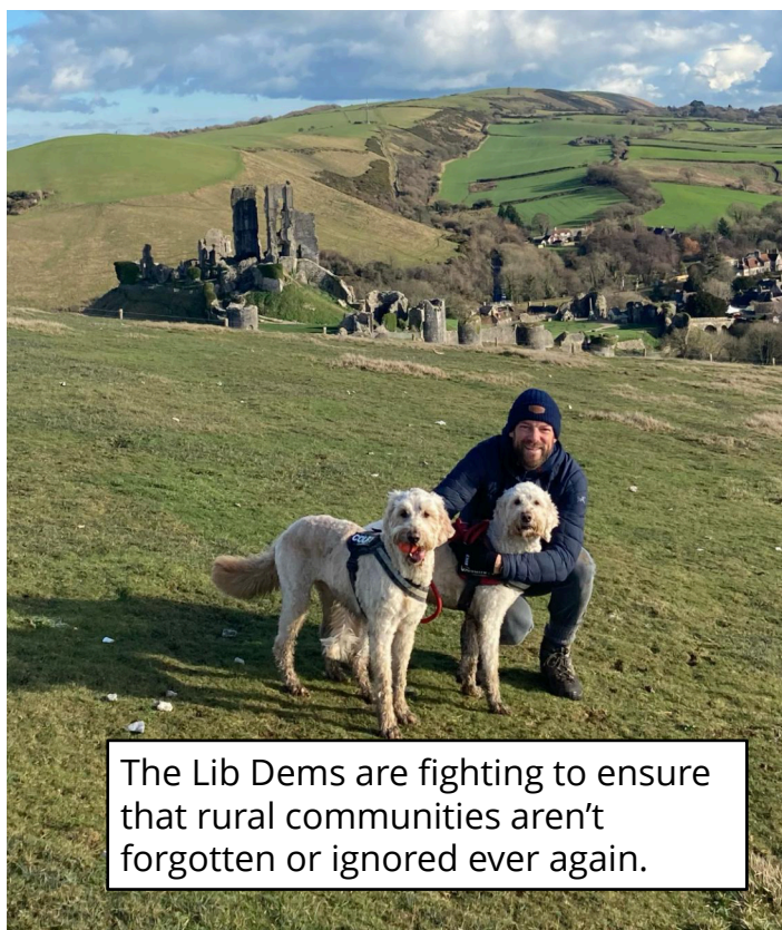
The Lib Dems are fighting to ensure that rural communities aren't forgotten or ignored ever again.

Rural communities and businesses are being neglected and let down by this out of touch Conservative Government.