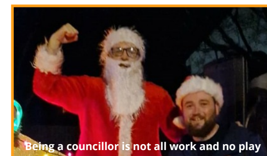
Being a councillor is not all work and no play